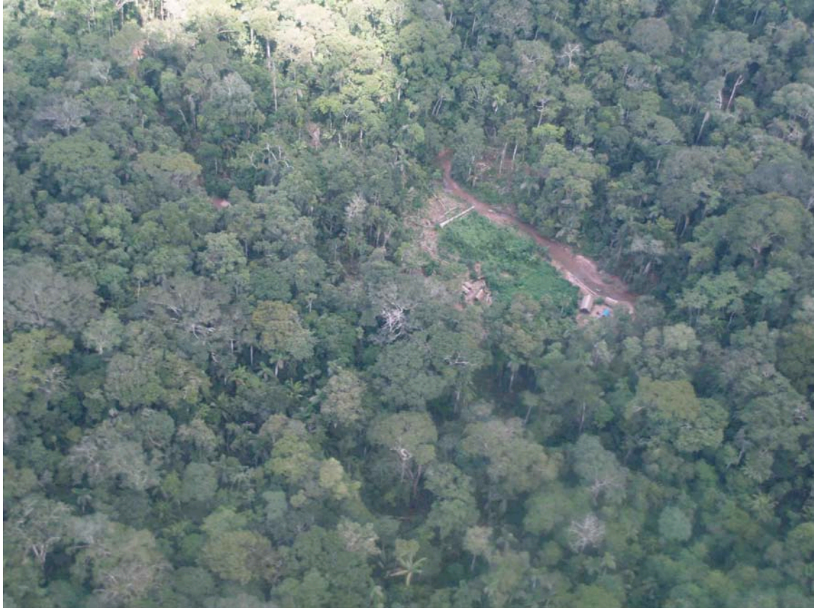
A logging camp inside the Murunahua Territorial Reserve near the boundary of the Alto Purús National Park (Photos: Chris Fagan 3/09)