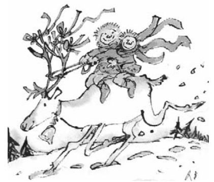
'A Christmas Ride' designed exclusively for Survival by the world's best loved illustrator, Quentin Blake.

Our 2008 raffle was another great success, helping to raise over £16,000 for our work for tribal peoples. The raffle had a particularly ethical theme; top prize was a luxury two-night stay for up to six people in the stunning Yorkshire Dales, with eco-friendly Natural Retreats. Several runners up also won luxury prizes, including organic garden boxes, wooden deck chairs made in the UK from sustainable beech, and three nights in an exclusive eco-camp in south-west France.