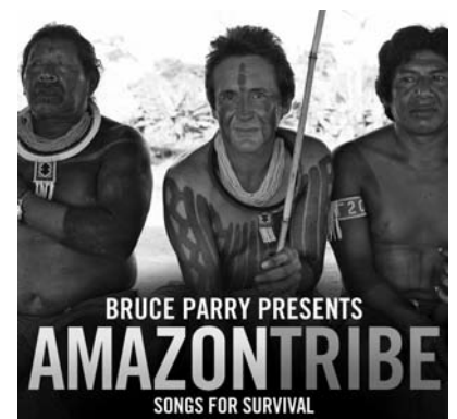
BBC TV presenter Bruce Parry brought together leading artists including KT Tunstall, Yusuf Islam and Johnny Borrell for the fundraising CD, Songs for Survival .